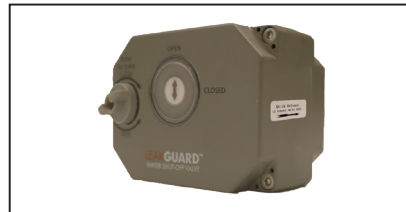
Shutoff Valve (SP21172)

In keeping with its policy of continuous progress and product improvement, Rheem reserves the right to make changes without notice.