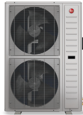
4 ton RD17AZ48AJ3NA