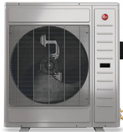
3 ton RD17AZ36AJ3NA