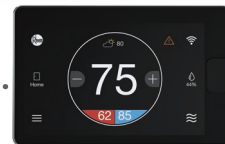
EcoNet Smart Thermostat