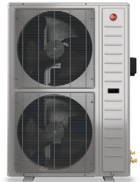
5 ton RD17AZ60AJ3NA